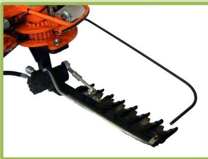
FOR CUTTING GRASS WITH SENSOR ROD ON.